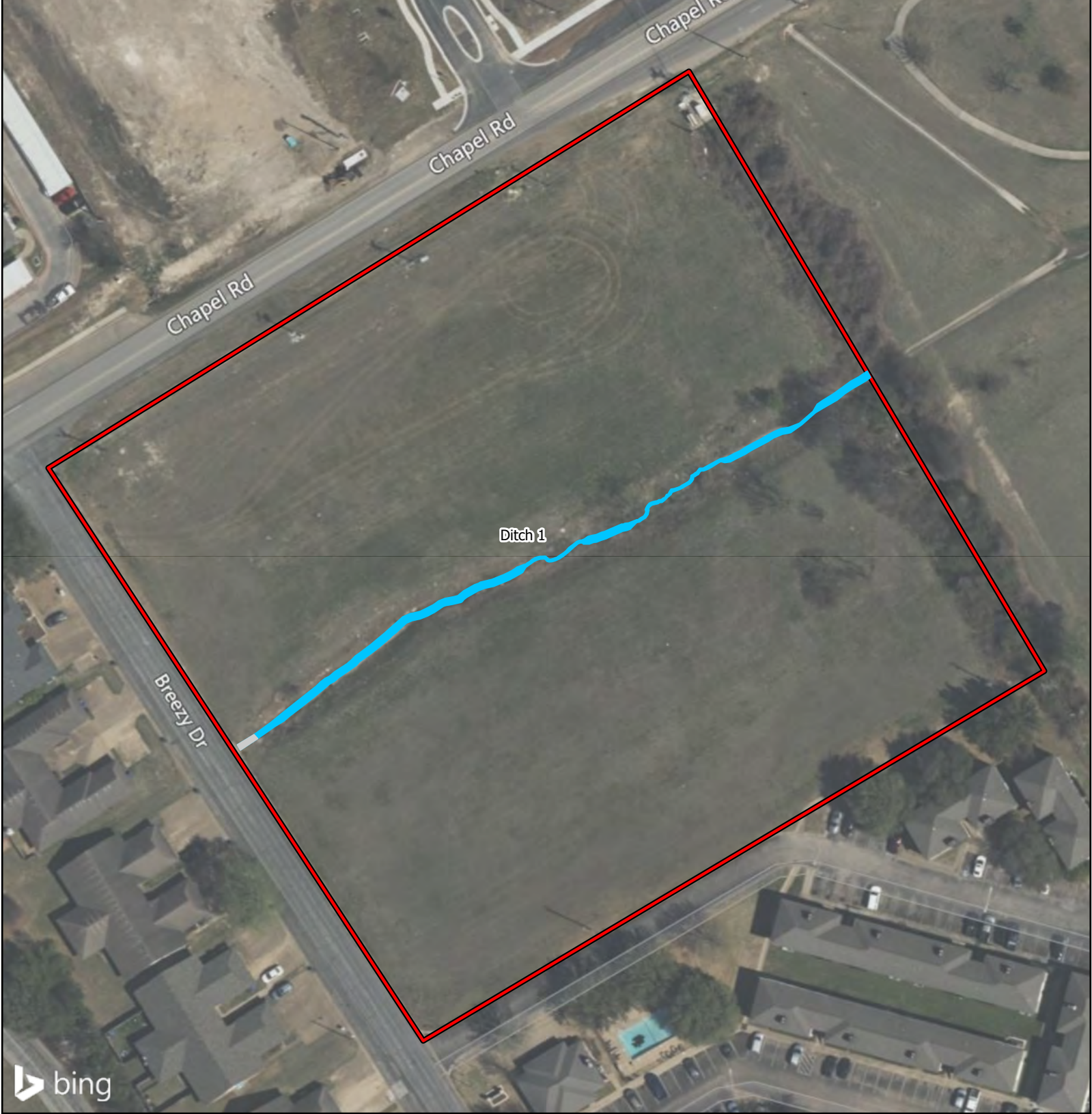
Figure 2. Aquatic Features Identified within the Survey Area

9720 Chapel Road City of Waco McLennan County, Texas